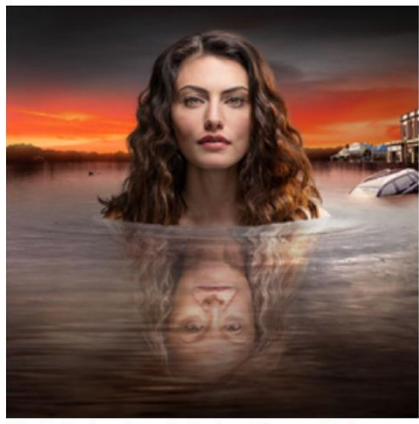
Fig.5: 1x1 - sh-ar1x1-descBloom_S1.jpg