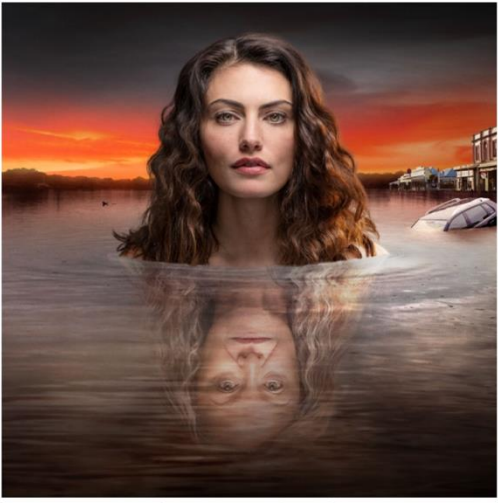
Fig.3: APPLE - sh-arAPPLE-descBloom_S1.jpg