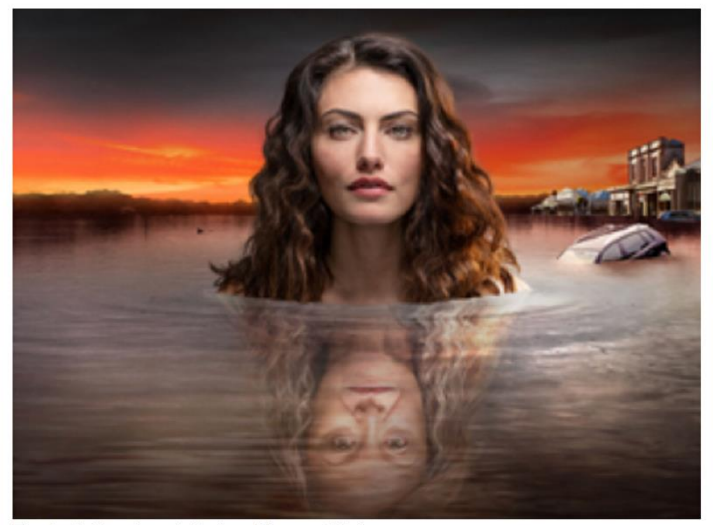
Fig.4: 4x3 - sh-ar4x3-descBloom_S1.jpg