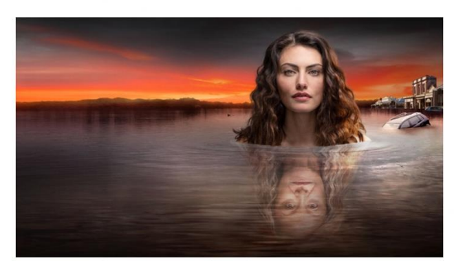
Fig.2: HD - sh-ar16x9-ver1-descBloom_S1.jpg