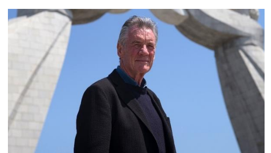
Figure 6: ep-ar16x9-descMichael_Palin_In_North_Korea_S1_Ep1.jpg