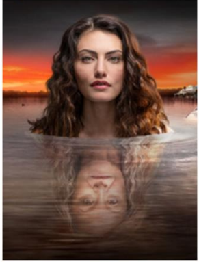
Fig.6: 3x4 - sh-ar3x4-descBloom_S1.jpg