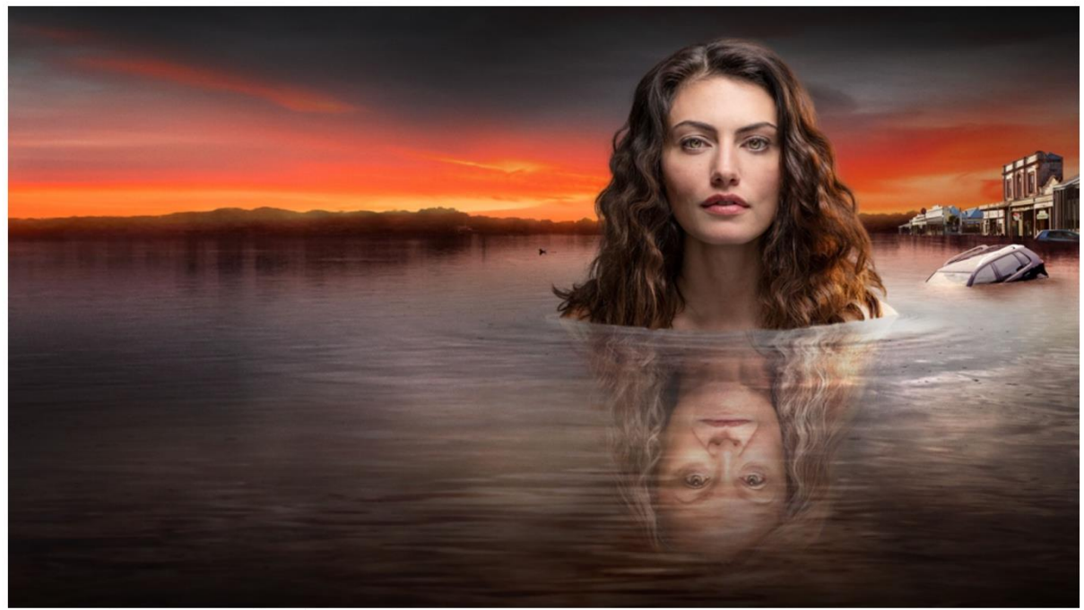
Fig.1: 4K - sh-ar16x9-ver1-descBloom_S1.jpg